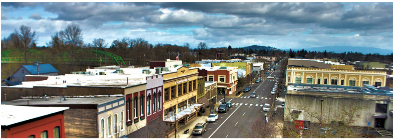
Albany, Oregon, SCYP partner 2016-17

The University of Oregon Sustainable Cities Initiative is now accepting proposals from cities, counties, special districts, ports, tribes, and regional partnerships to be the partner for the Sustainable City Year Program (SCYP) for the academic year beginning fall 2017. The successful applicant will benefit from between 40,000 and 80,000 hours of work by University of Oregon students and faculty members, from a variety of disciplines, working to advance the partner's sustainability projects. Prior partners are Redmond, Gresham, Salem, Springfield, and Medford; our current partner is Albany. The partner must support the effort through staff time and the payment of a fee. The selection process is competitive. The deadline for applications is January 31, 2017.