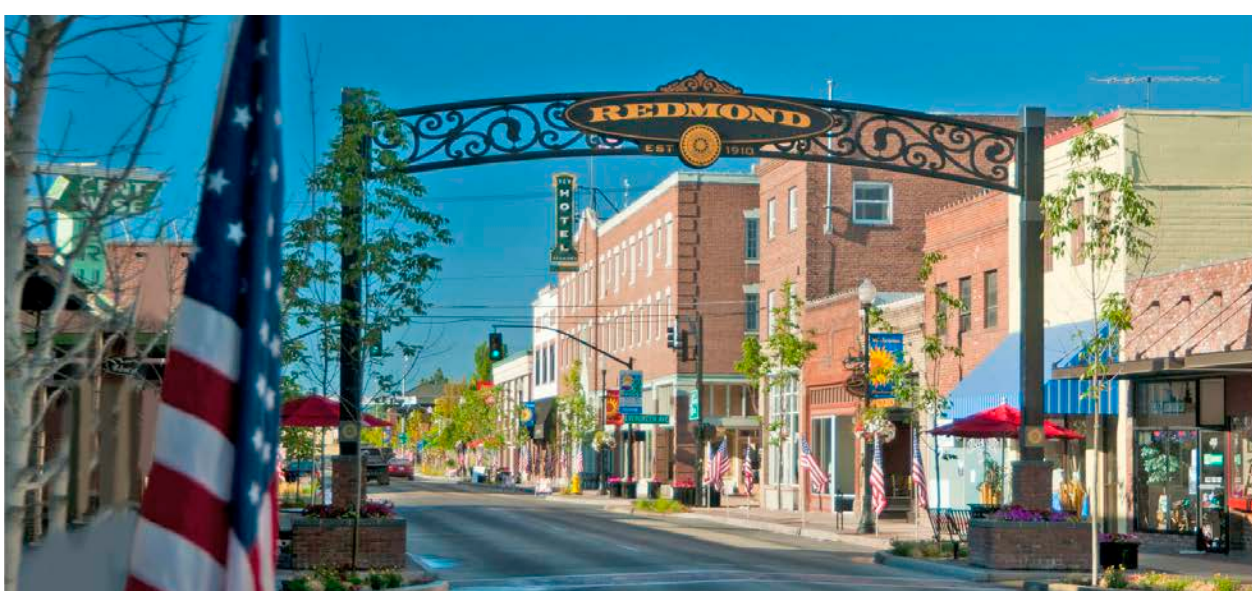
Redmond, Oregon, SCYP partner 2015-16

A key element of a successful SCYP program is staff involvement. The partner must have one or more staff champions for SCYP, preferably a city / county / district manager or another person within the partner who has the ability to direct and motivate staff to participate in the partnership. SCYP projects will be successful only with staff participation. The partner will identify specific staff to serve as points of contact and to collaborate on each project with SCYP faculty and students. Our past partners report that for each project, 1-3 staff spent about one full day every two weeks (about 0.1 to 0.3 FTE for each term that the project is in progress) preparing background materials, accompanying students on site visits, and participating in reviews and presentations of student work. Before the start of the academic year, the partner needs to compile and provide documents, including but not limited to, prior concept plans, vision documents, architectural renderings, computer-aided drawings, GIS maps and layers, community datasets, and aerial photographs.