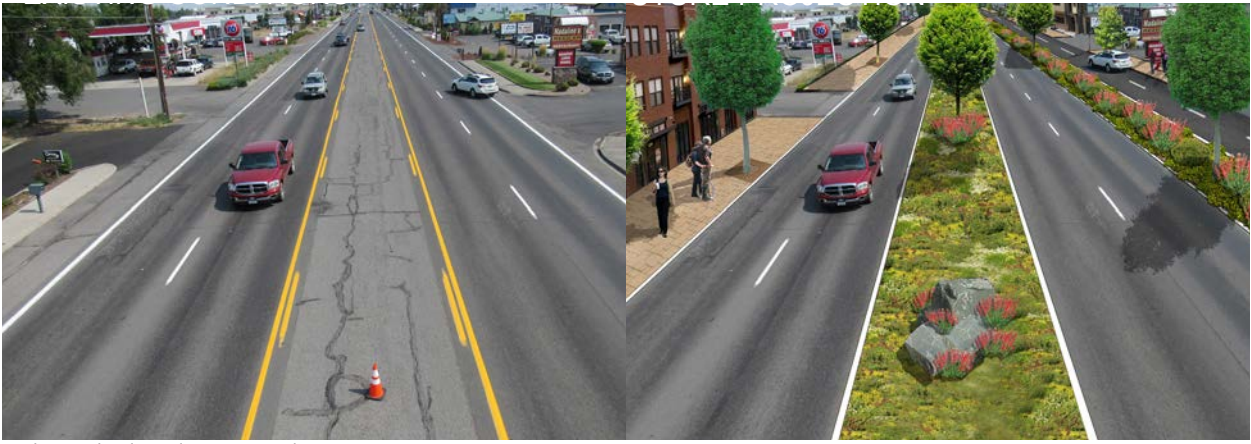
Multi-way boulevard current condition