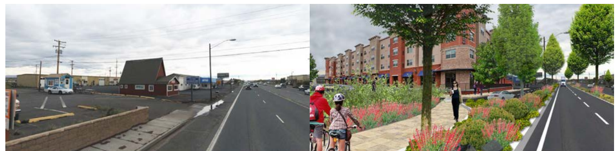
Village commercial current condition

SCI will identify and tentatively match university faculty and courses with proposed projects as part of its review of each partner's application. Project timelines should not exceed nine months, and should ideally be compatible with the University of Oregon's three 11-week academic terms: fall (September-December), winter (January-March), and spring (April-June). The UO Law School operates on a semester schedule; fall runs from August to November, and spring is January to May.